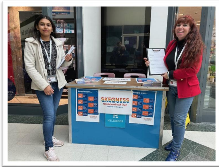
Consultation was carried out in the Hildred's Centre this autumn

Plans for the multi-million pound Pride in Place funding in Skegness have been finished, approved by East Lindsey District Council Executive, and submitted to government.