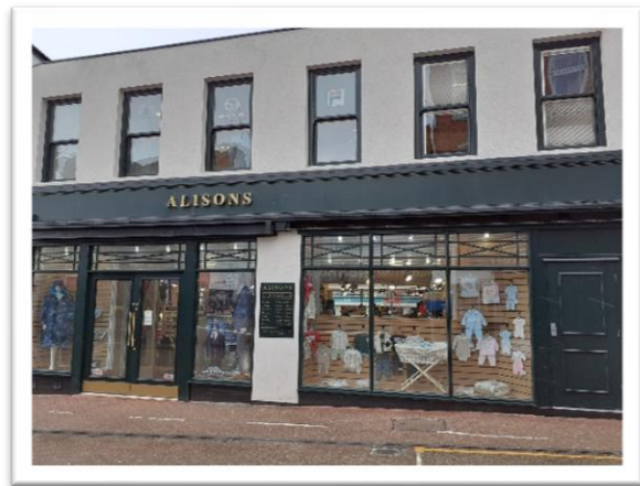
Alisons is one of the businesses on Lumley Road that has benefitted from the Town Centre Transformation programme

The Town Centre Transformation programme is continuing to make an impact in the town. Along with the Tower Cinema works, funding for shopfront improvements to over 30 local businesses has been agreed. All of the first phase of projects have been completed and the next phase are due to start on site in the next month, so keep an eye out for scaffolding on Lumley Road.