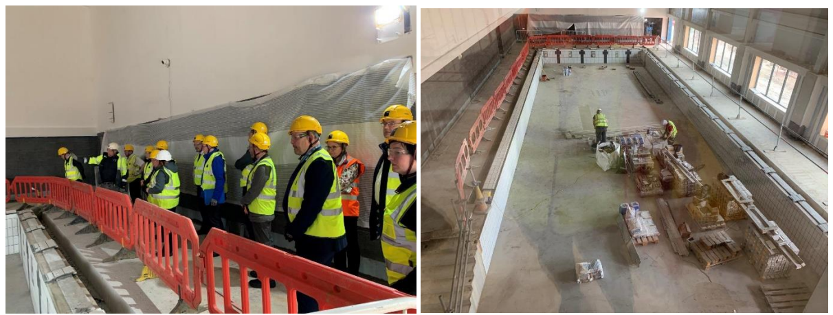
Attendees at the event viewing the swimming pool (left), and an overhead view of the new pool (right)

Magna Vitae will be holding an event for residents, members, and staff past and present to say farewell to Station Sports Centre. In addition, a programme of community activities is also being arranged to ensure people have access to facilities during the short closure. Station Sports Centre members will also have access to other Magna Vitae facilities in Louth, Skegness and Horncastle during the closure.