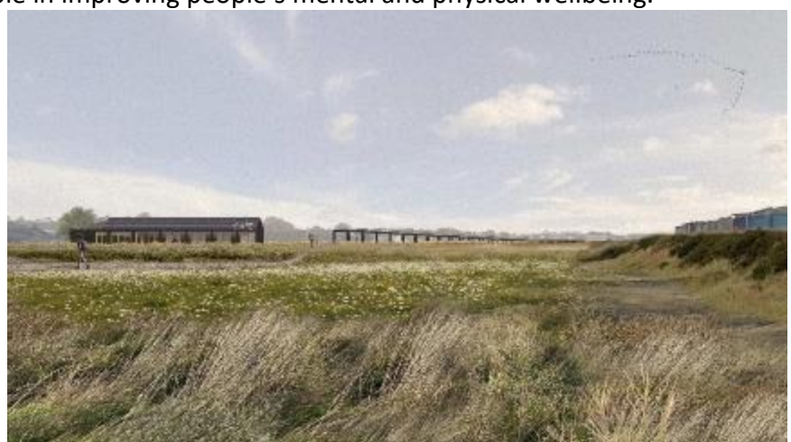
Artist Impression of welcome hub

National Trust Sandilands provides a fantastic opportunity for local people and visitors alike to experience our wonderful coastline. The new visitor hub is set to offer a welcoming base, and by helping people to get involved in nature and wide-open spaces it will play an important role in improving people's mental and physical wellbeing.