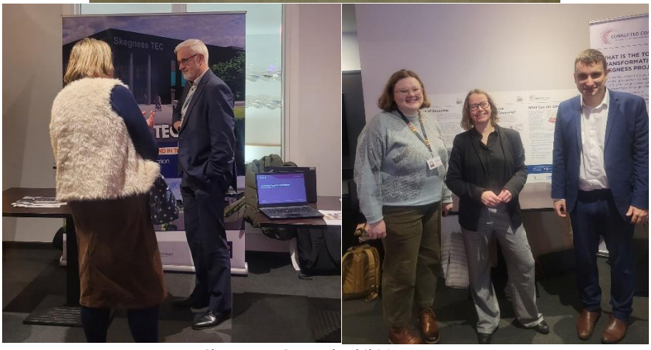
Skegness AGM and Exhibition event